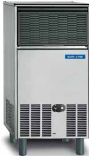
B 7540 AS/WS

Bar Line Equipment range is the newly released EU made ice makers for Thimble-shaped rounded ice cubes coming from Bar Line. Built in the Italian manufacturing plant of Frimont Spa, ISO 9001 Certified, these units are built with sturdy, corrosion resistant stainless steel, and feature European made componentry to assure maximum quality and reliability. Tested one by one, the Bar Line self contained units feature well balanced ratio between production and storage capacity, alongside with reduced outer dimensions that allow for built-in installations. Front air louvers assure appropriate airflow in critical install requirements. Contemporary, elegant design unites excellent operational features with the reliability obtained through years of successful experience in ice making technology. Insulated bin door and ice storage bin minimize air condensation and water formation on equipment surfaces. Electromechanic controls maximise reliability and ease of repair during the entire life of the equipment.